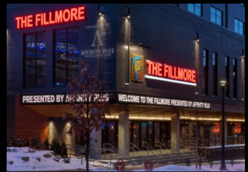
Title Sponsor package includes recognition on The Fillmore Theater marquee in the heart of downtown Minneapolis.