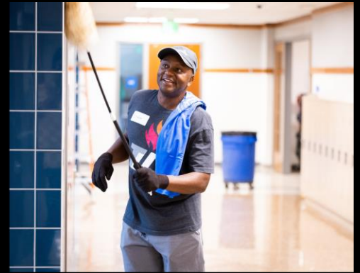
Employees from SportsEngine / NBC SportsNext joined ACES for a Back-to-School Community Cleanup volunteer day. ACES is eager to work with top sponsors to arrange meaningful volunteer and other engagement opportunities.