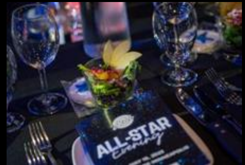
Top sponsors also receive full-color ad placement in the printed event program, distributed to 500+ guests.